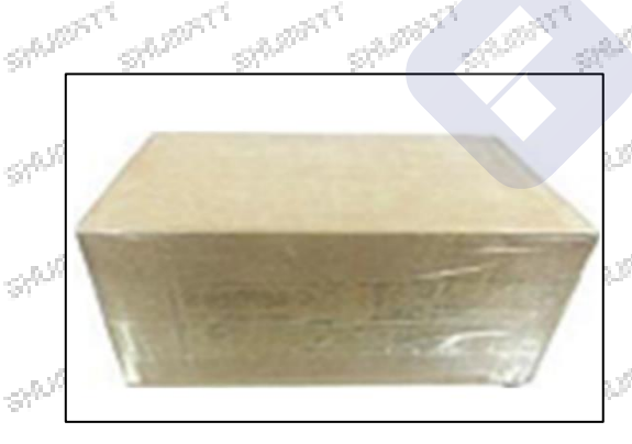
Pic No. 1 Domestic express packaging: Wrapped by Transparent tape

Minors are prohibited from using transparent tape, yellow tape, black wrapping protective film, and white wrapping protective film to avoid personal injury.