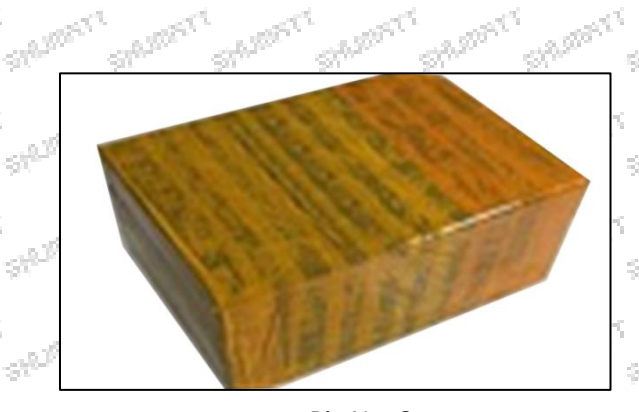
Pic No. 2 International express packaging: Wrapped with yellow tape after wrapping black protective film

Mob/WhatsApp: +86 13410541523 Tel: +8675523215133