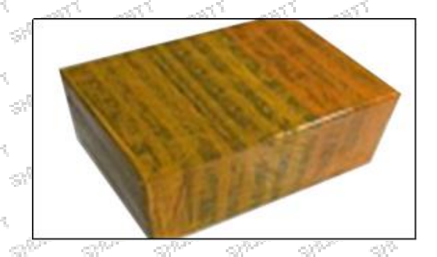
Pic No. 3 International express packaging: Wrapped with yellow tape after wrapping black protective film 1000