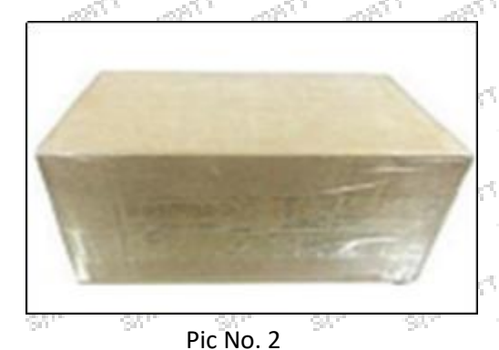
Domestic express packaging: Wrapped by Transparent tape

oldsymbol{\mathbb{A}} Minors are prohibited from using transparent tape, yellow tape, black wrapping protective film, and white wrapping protective film to avoid personal injury.