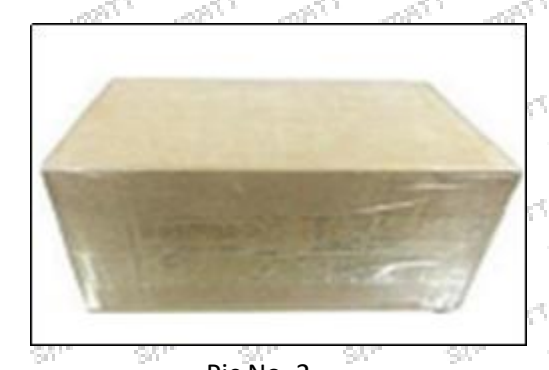
Pic No. 2 Domestic express packaging: Wrapped by Transparent tape

oldsymbol{\mathbb{A}} Minors are prohibited from using transparent tape, yellow tape, black wrapping protective film, and white wrapping protective film to avoid personal injury.