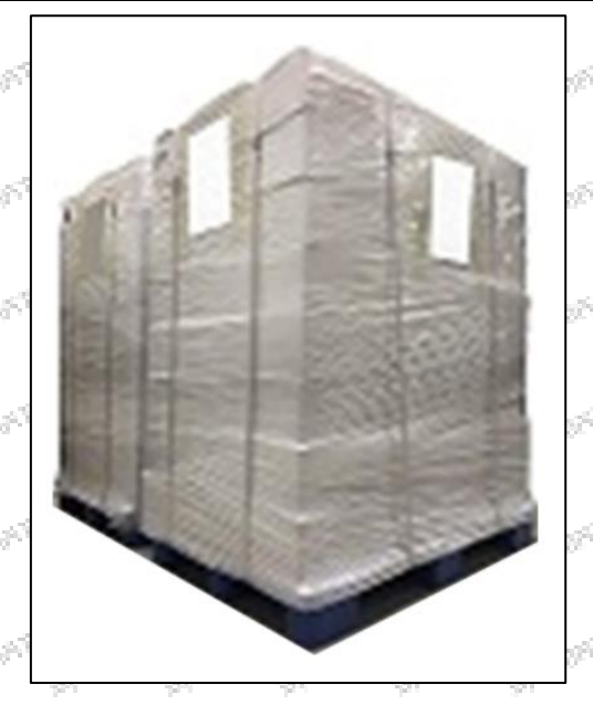
Pic No. 4

Pallet Shipping: Use pallet that meet export requirements, and use white wrapping protective film to wrap and bind with cable ties