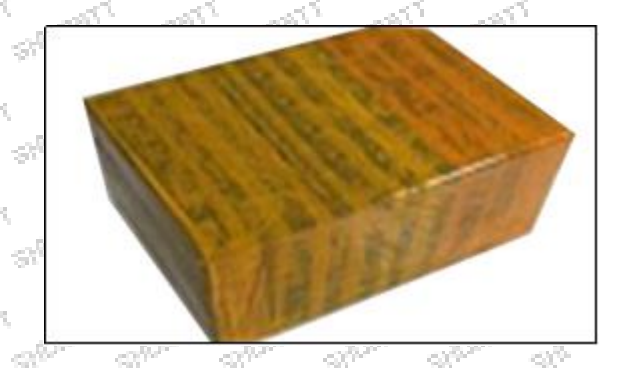
Pic No. 3 International express packaging: Wrapped with yellow tape after wrapping black protective film 1000