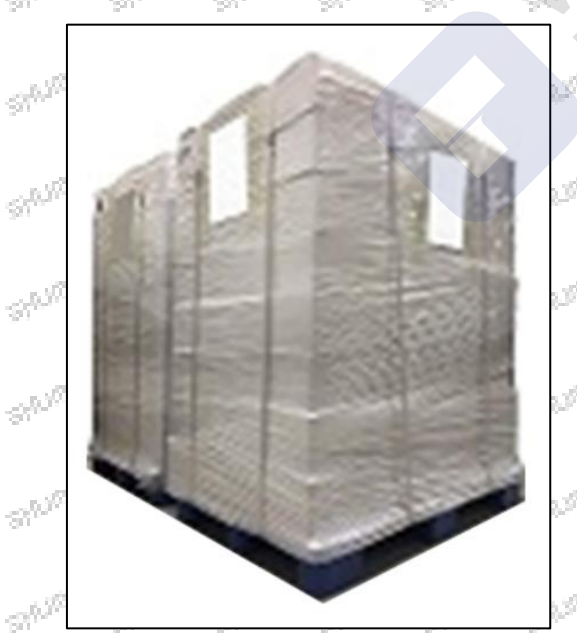
Pic No. 3

Pallet Shipping: Use pallet that meet export requirements, and use white wrapping protective film to wrap and bind with cable ties