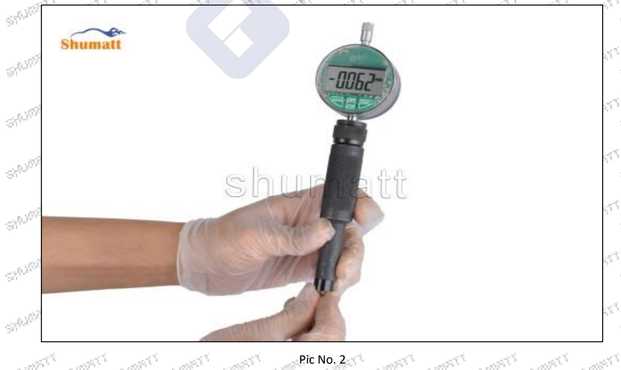
Pic No. 2

(2) Check whether the armature stroke (CRT220) of the control valve is within the range of 30~70μm. The lift of the armature will affect the fuel injection quantity at each point. The greater the armature lift, the greater the fuel injection volume, if the armature stroke is out of range, please replace control valve in time.