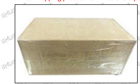
Pic No. 1 Domestic express packaging: Wrapped by Transparent tape

Minors are prohibited from using transparent tape, yellow tape, black wrapping protective film, and white wrapping protective film to avoid personal injury.