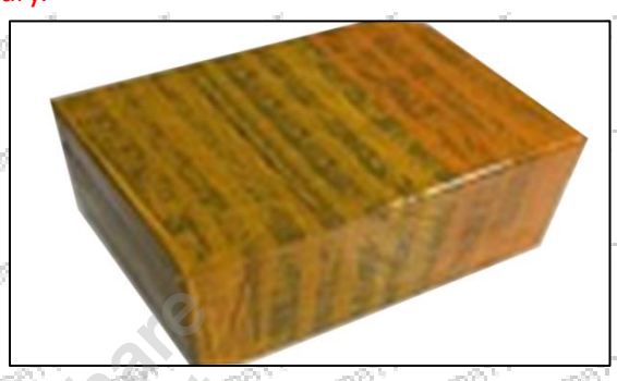
International express packaging: Wrapped with yellow tape after wrapping black protective film