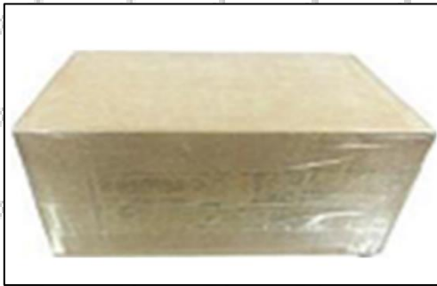
Pic No. 1

Domestic express packaging: Wrapped by Transparent tape