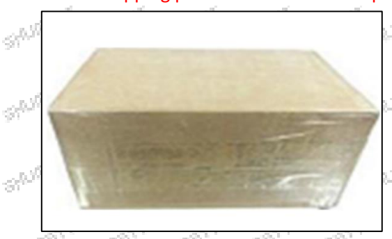
Pic No. 1 Domestic express packaging: Wrapped by Transparent tape