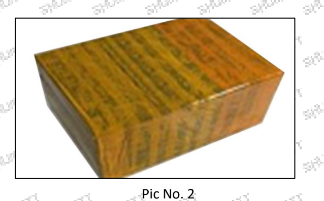
International express packaging: Wrapped with yellow tape after wrapping black protective film