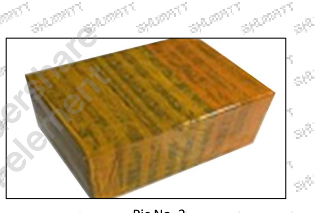
Pic No. 2 International express packaging: Wrapped with yellow tape after wrapping black protective film