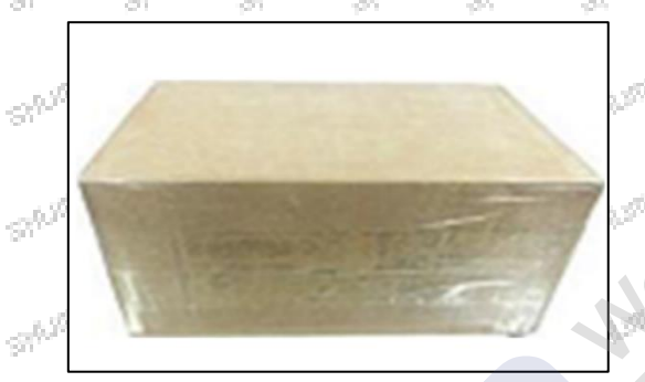
Pic No. 1 Domestic express packaging: Wrapped by Transparent tape

Minors are prohibited from using transparent tape, yellow tape, black wrapping protective film, and white wrapping protective film to avoid personal injury.