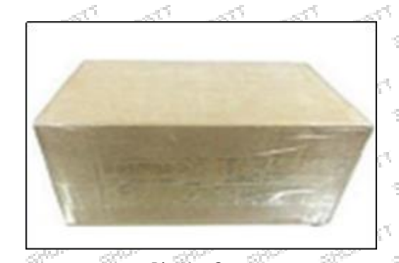
Pic No. 2 Domestic express packaging: Wrapped by Transparent tape

A Minors are prohibited from using transparent tape, yellow tape, black wrapping protective film, and white wrapping protective film to avoid personal injury.