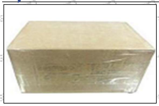
Pic No. 1 Domestic express packaging: Wrapped with Transparent tape