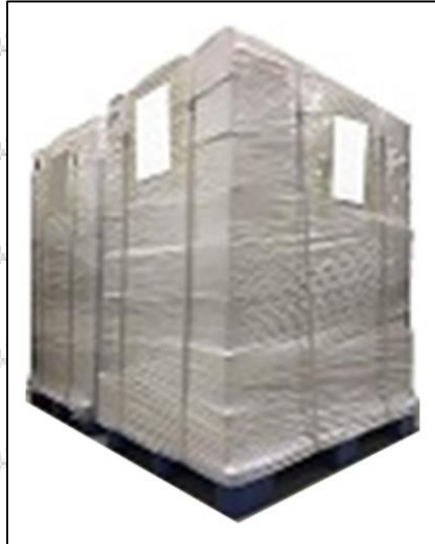
Pic No. 3

Pallet shipment: Use pallets that meet export requirements and wrap with white plastic wrap and tie.