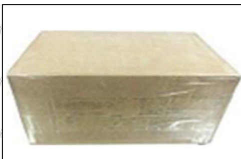
Pic No. 1

⚠ Minors are prohibited from using transparent tape, yellow tape, black wrapping protective film, and white wrapping protective film to avoid personal injury.