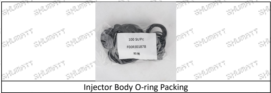
Injector Body O-ring Packing

(1) Injector Body O-ring Customized Service Coverage: Meet the customized needs of OEM manufacturers for shell lettering, logo engraving, injector body O-ring internal packaging, injector body O-ring external packaging and labels customized, etc.